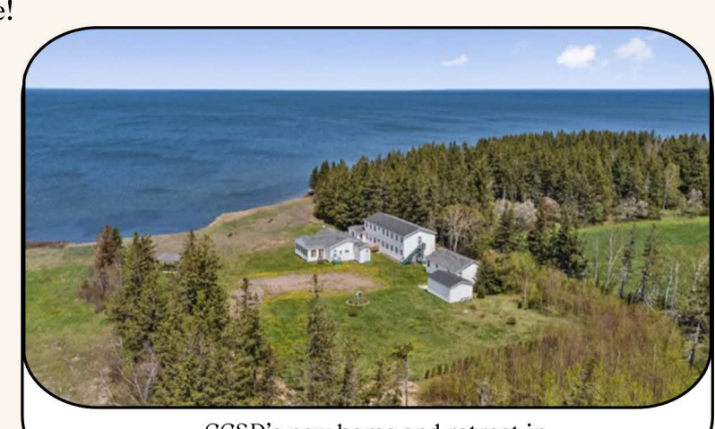
CCSD's new home and retreat in Grand Digue, New Brunswick.

Hope to see you all at the National Deaf Arts & Culture Festival, July 31 - August 4, 2024, Halifax, Nova Scotia!