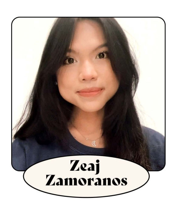
CSJ Communications Coordinator

"I would like to recognize and thank Sign Language Institute Canada (SLIC) for giving me an opportunity to work with a wonderful team. I was able to connect and develop networking opportunities with Deaf Canadians. SLIC have brought me back "HOME" and I would like to extend my thanks to Canadian Cultural Society of the Deaf for making this happen.