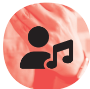
Signed Music Composer