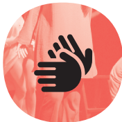
Signed Music Lyricist